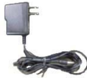
AC Adapter 30015